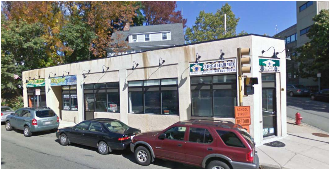
415 Medford Street